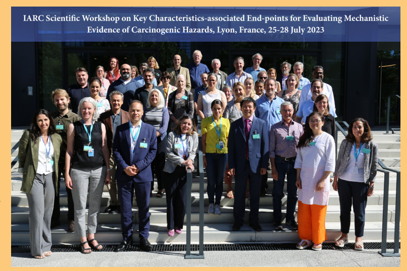
Participants and IARC Secretariat at the 2023 Key Characteristics Workshop

Since its introduction, the key characteristics of carcinogens (KCs) framework has been applied to 99 agents evaluated in 23 volumes of the IARC Monographs . This framework has brought uniformity to IARC Monographs assessments and allowed a focused systematic review of the publicly available literature on mechanisms of carcinogens. Importantly, it has contributed to advancing the science by which mechanistic evidence is used to evaluate potential carcinogens. Thus, it was considered timely to review aspects of how the KCs have been applied in past years, especially after the update to the Preamble, and to discuss